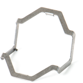
fig. 1. Dimensions (mm)