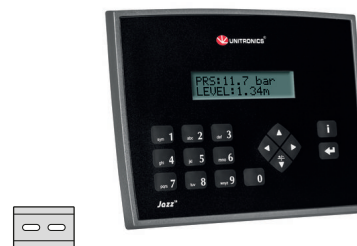
fig. 1. Dimensions (mm)