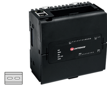
fig. 1. Dimensions (mm)