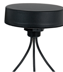
fig. 1. Dimensions (mm)